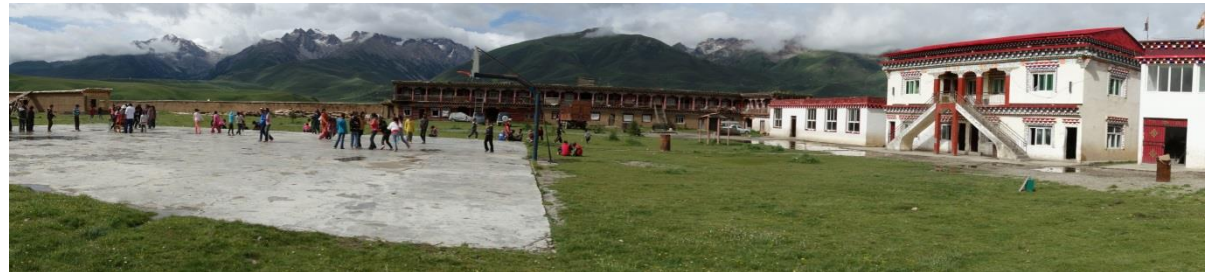
XieQing Orphanage campus.