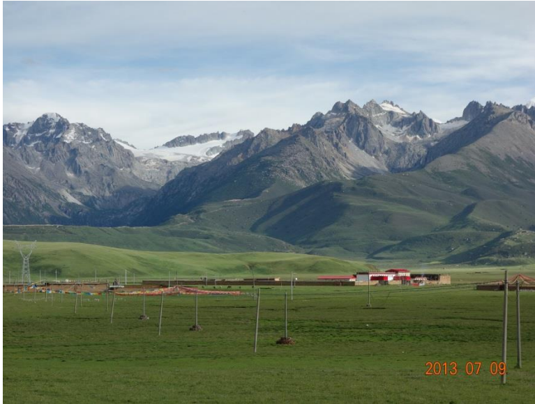
XieQing Orphanage in the shadow of Lousi Chuan Glacier.