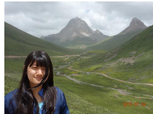
En-route from YuShu to Little Surmang.